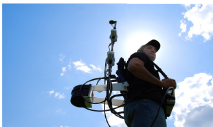
Walking Gradiometer with VLF-EM and GPS

The firmware provides the convenience of upgrades over the Internet via the GEMLink software. The benefit is that instrumentation can be enhanced with the latest technology without returning the system to GEM resulting in both timely implementation of updates and reduced shipping / servicing costs.